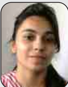
SEWA 1747/2100 (83.19%) IIIRD Position